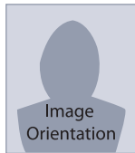
INSIDE LEFT PANEL ( when folded )

You MUST delete this layer or it will be printed in your finished product.